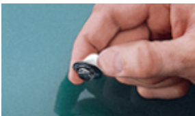
Peel away Stick-a-Stud™ fasteners protective backing