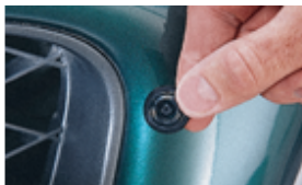
Adhere Stick-a-Stud™ fasteners to vehicle