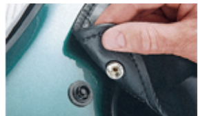
Snap on Winter Front or Bug Screen