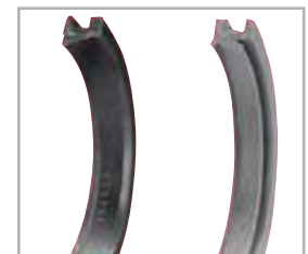
Single Lip (left) Double Lip (right)

For certain applications, Fel-Pro offers a choice of single lip, offset lip, or double lip design as shown in the catalog entry.