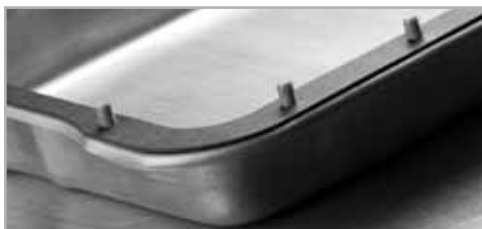
Hole-Locks® in action