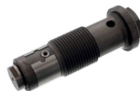
febi no. 40152

Fits: Mercedes-Benz models with M271 engine (EVO) and inverted tooth chain Repl. no. 271 589 07 63 00