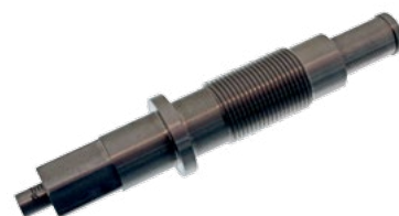
Measuring chain tensioner febi no. 40125

Fits: Mercedes-Benz models with M271 engine (EVO) and inverted tooth chain Repl. no. 271 589 07 63 00