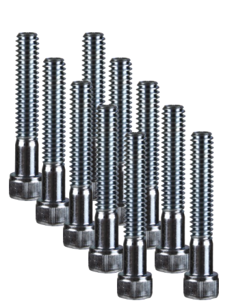
SHCS14Z015Z (10) 1/4"-20 x 1 1/2"