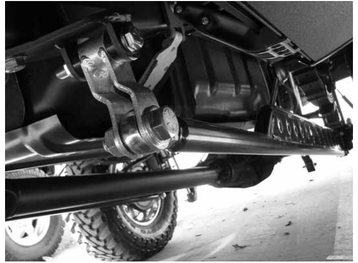
FRONT OF TRUCK FACING THE REAR