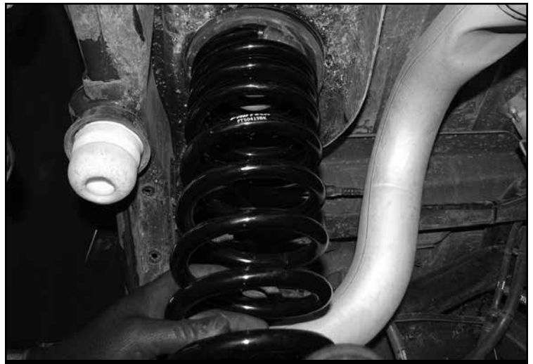
FIGURE 2 - STEP 11