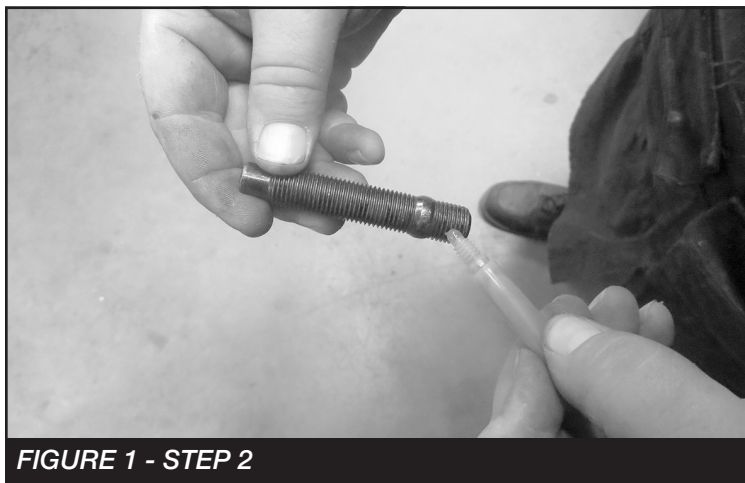
FIGURE 1 - STEP 2