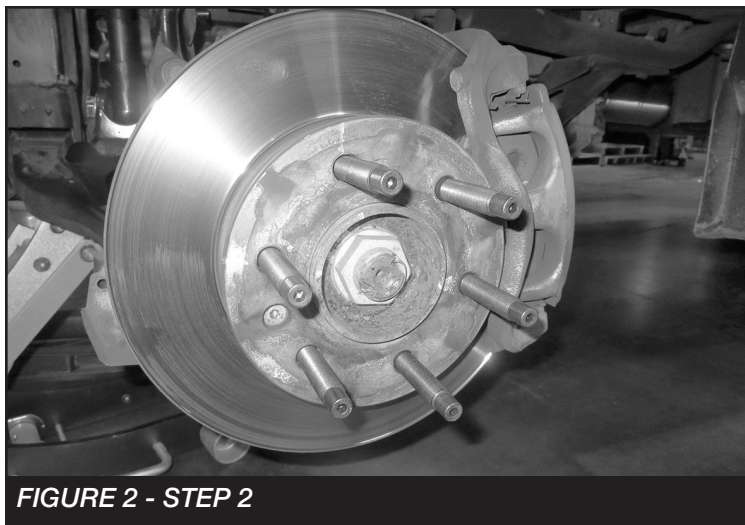
FIGURE 2 - STEP 2