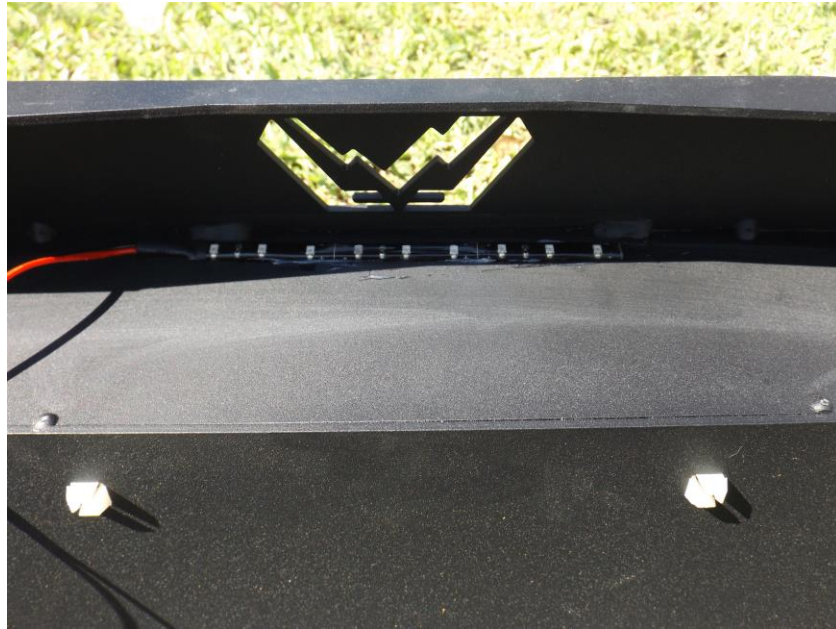
Figure 5 – LED Strip Location