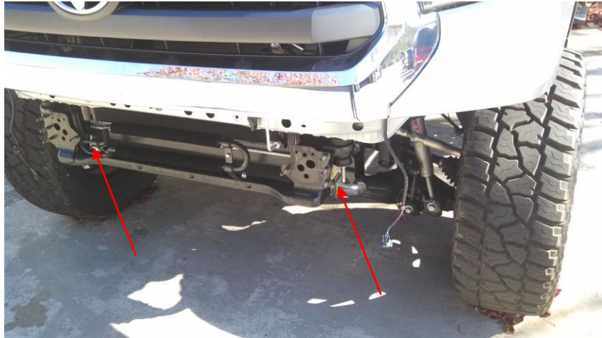
Figure 3 - Factory Bumper Connection