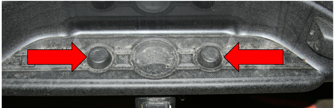
Figure 2 – Bolt cover removal

C. Using 19mm or 3/4" sockets and wrenches, remove the two vertical bolts holding the OEM bumper the trailer hitch bar. If this is the first time that the bumper has been removed, these may be difficult to break loose.