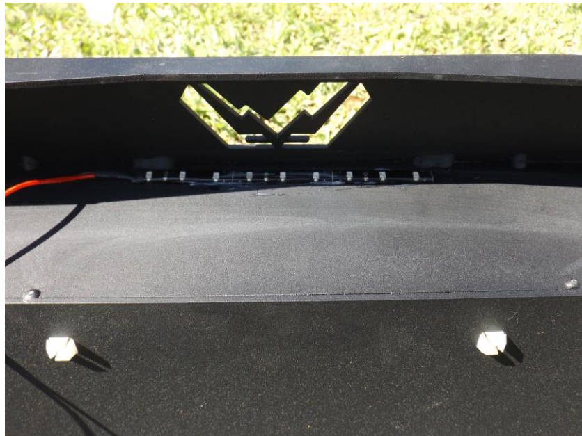
Figure 5 – LED Strip Location