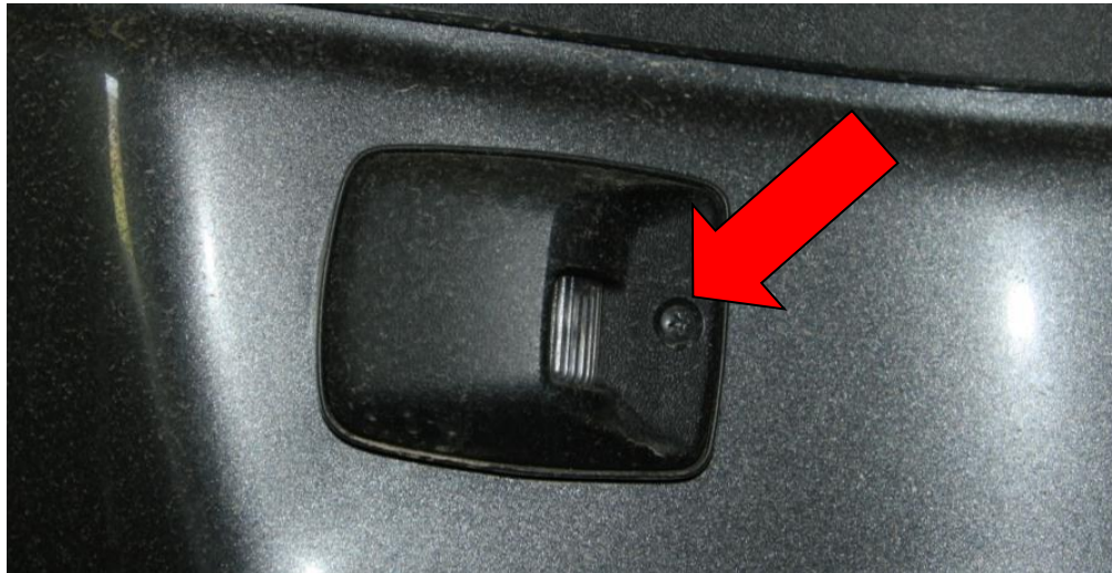
Figure 1 – License plate light removal

A. Remove the license plate lights by removing the small Phillips screws and pulling the housings from the bumper. You will have to disconnect the harnesses from each.