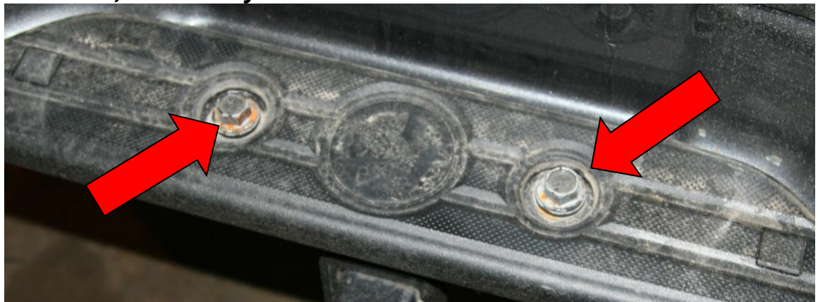
Figure 3 – Trailer hitch bolt removal

C. Using 19mm or 3/4" sockets and wrenches, remove the two vertical bolts holding the OEM bumper the trailer hitch bar. If this is the first time that the bumper has been removed, these may be difficult to break loose.