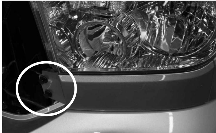
Figure 1 - Fascia Mount Screws