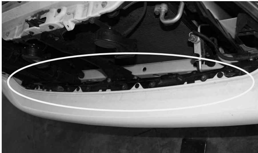
Figure 2 - Center Fascia Fasteners