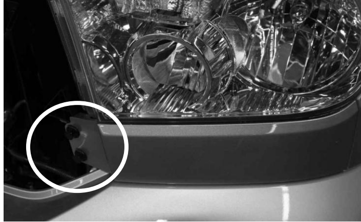
Figure 1 - Fascia Mount Screws