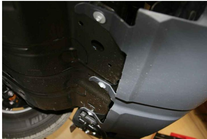
Figure 2 – LOWER BUMPER PLASTIC REMOVAL