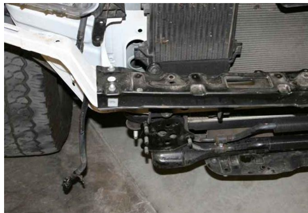
Figure 3 – BUMPER TO FRAME FASTENER REMOVAL