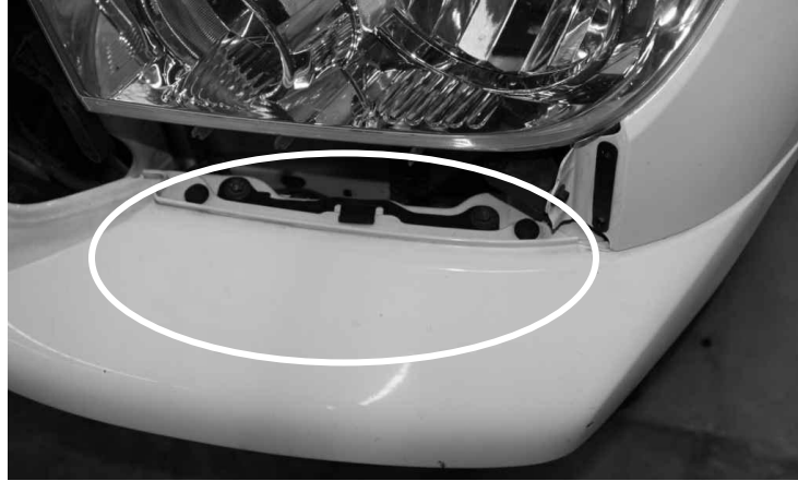
Figure 3 - Outer Fascia Fasteners