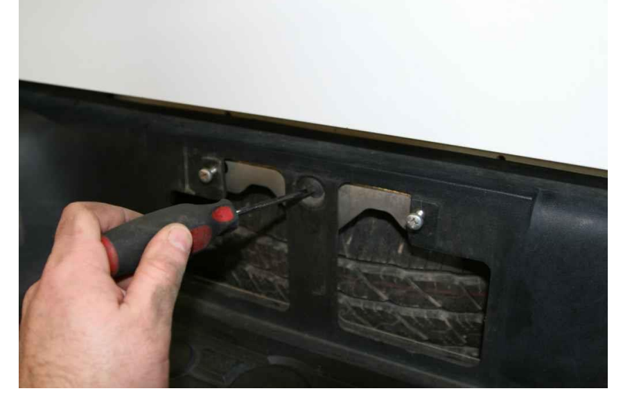
E. Pop the plastic clips loose on the bottom side of the main piece of plastic on the top side of the bumper allowing access to the OEM fasteners.

D. Remove the Phillips head screw passing through the plastic that was hidden by the license plate previously.