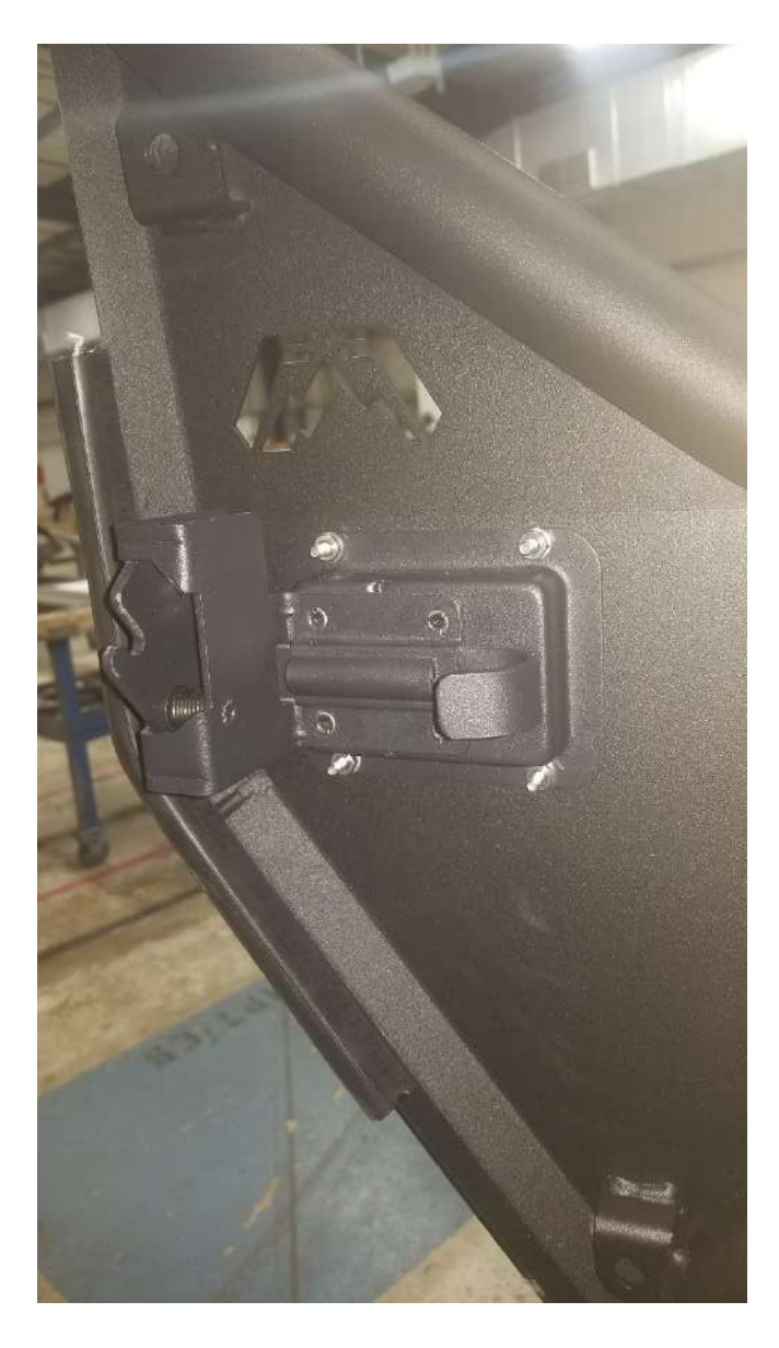
Figure 1: rear door latch orientation