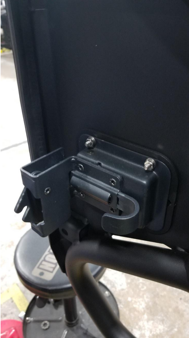
Figure1: front door latch orientation