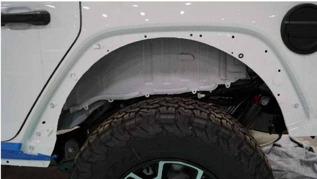
Figure 2. Remove white plastic clips that were left behind by OEM flare removal.

Repeat steps 1 through 3 for passenger side.