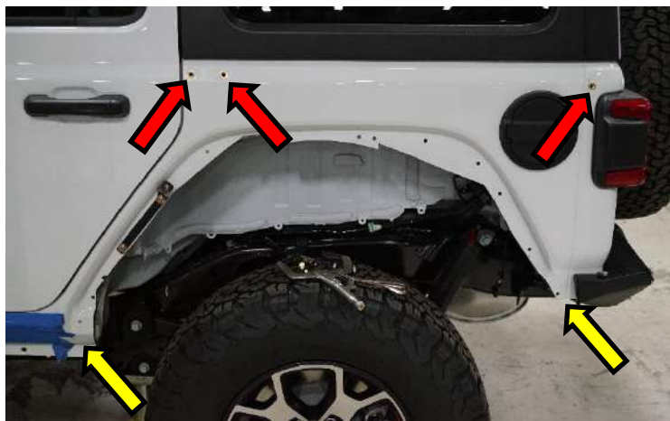
Figure 8. All rivet nuts installed and holes drilled. Red arrows indicate holes to drill out to \frac{17}{32} "; yellow arrows indicate holes to drill out to \frac{3}{8} ".

8. With all the holes drilled out to \frac{17}{32} " you can now begin installing rivet nuts with the provided rivet nut tool.