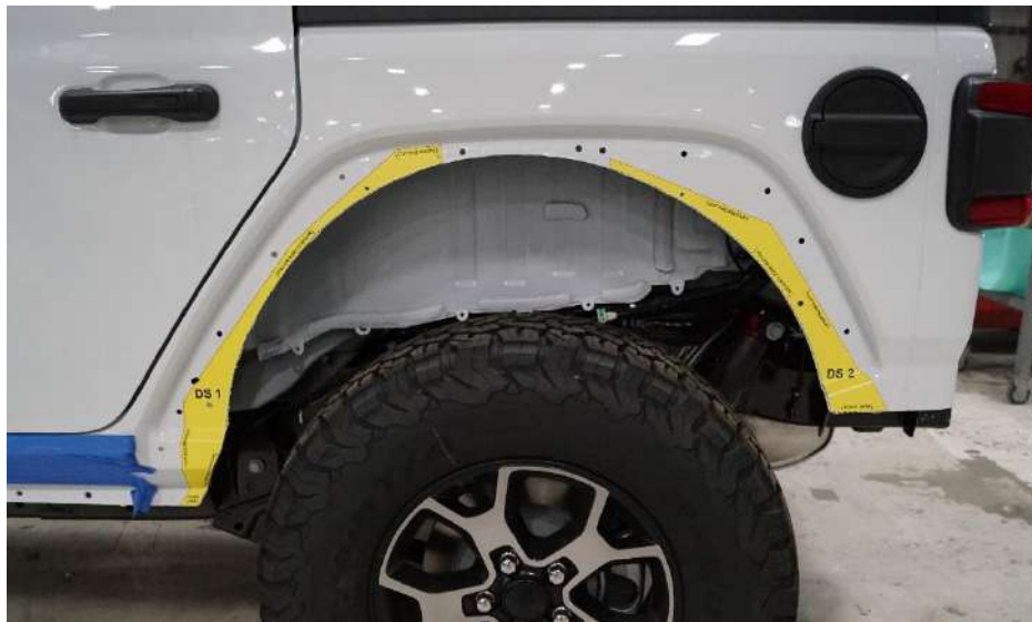
Figure 3. Template placement for DS 1 and DS 2