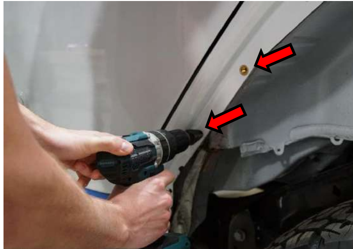
Figure 4. Drilling OEM holes wider to accommodate rivet nuts.