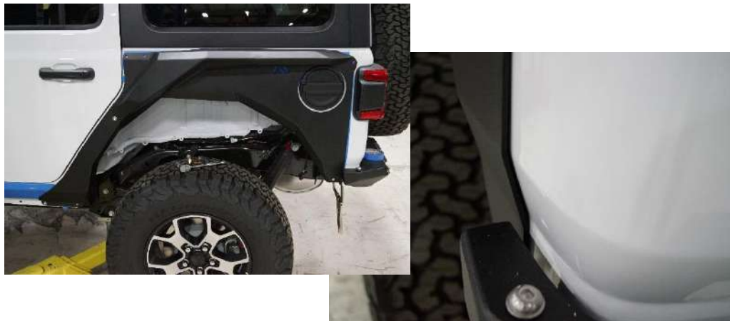
Figure 6a & 6b. Initial placement of fender for marking mounting points correctly.

5. Orient the rear of the fender to cradle the contours on the lower portion of the Jeep (see figures 6a & 6b) to correctly position the fender. Clamp at the lower back end when satisfied with the fender position.