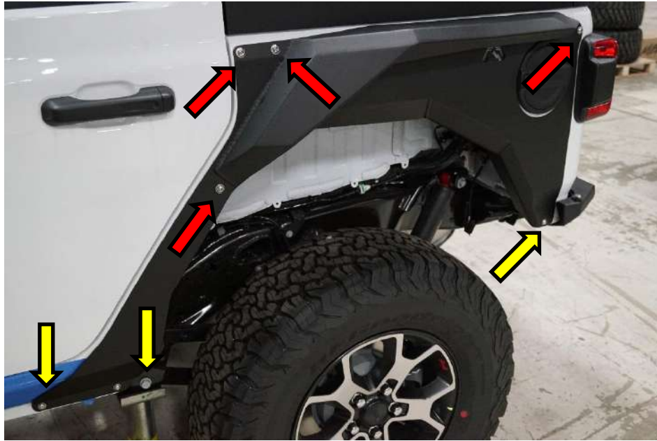
Figure 9. Locations for 3/8" SS hardware (red arrows) and 5/16" SS hardware (yellow arrows).

Repeat steps 1 through 10 to install other side.