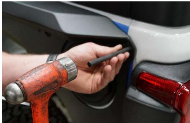
Figure 7. Marking hole locations with transfer punch.

6. With fender base held in place, using a transfer punch, mark the center of the mounting holes. Once holes are marked, remove fender base.