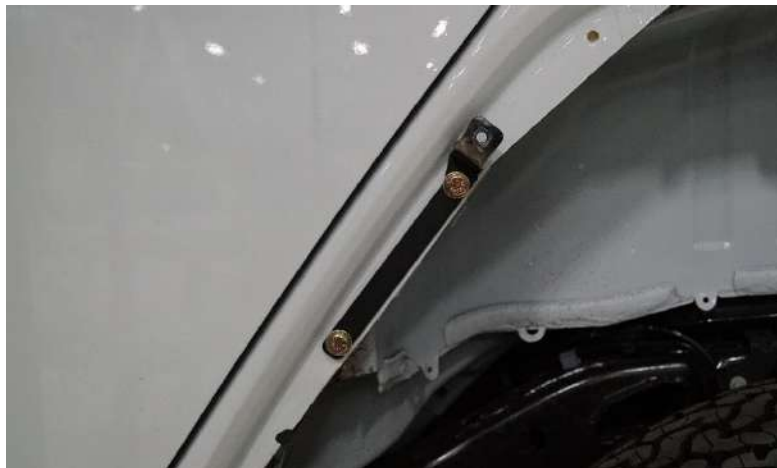
Figure 5. Body bracket installed with YZ hardware.