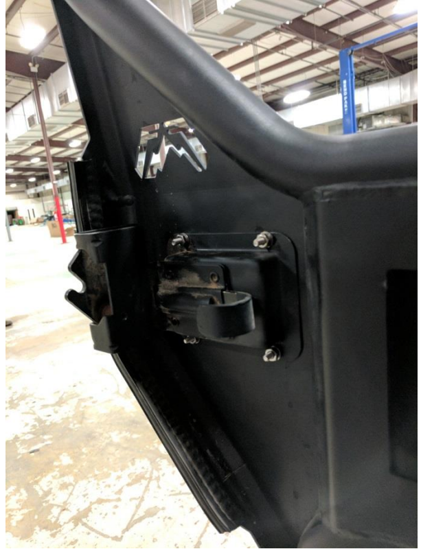
Figure 2: rear door latch orientation