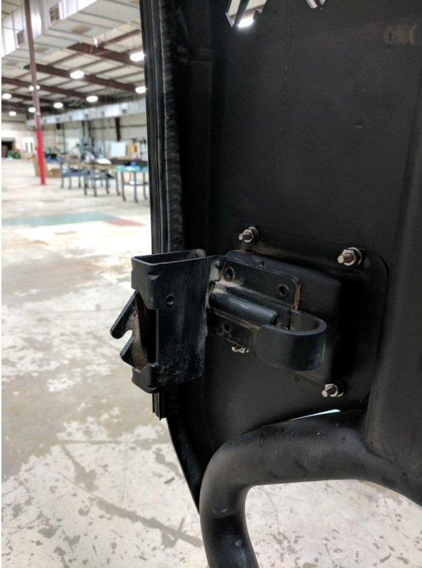
Figure 1: front door latch orientation