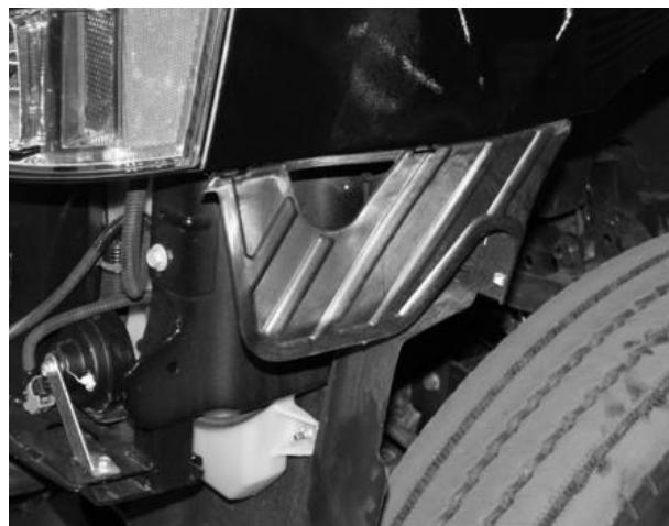
Figure 5 - SUPPORT STRUCTURE LOCATION