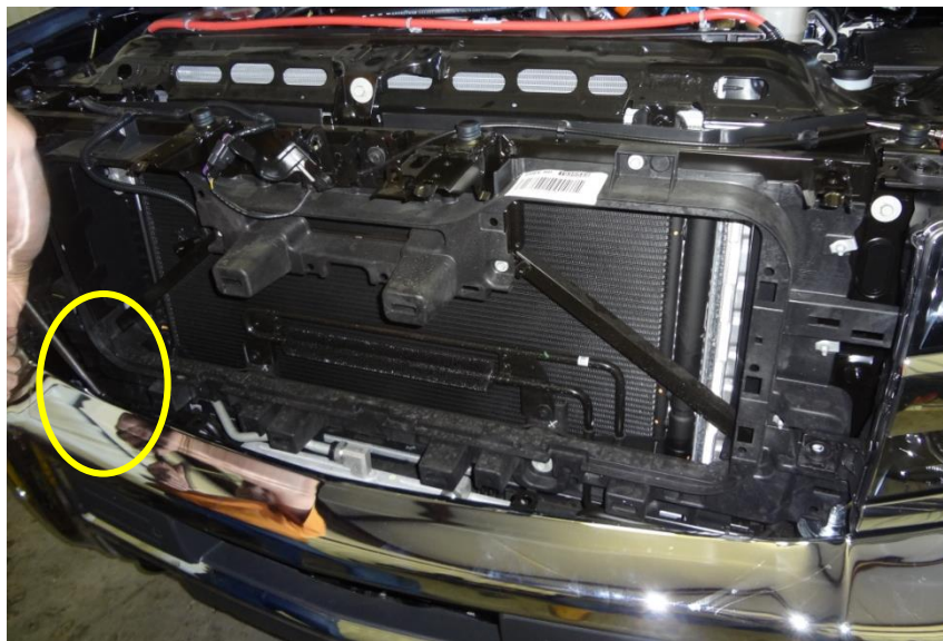
Figure 3b (BOLT ACCESS FOR TOP BOLT ON MOUNTING BRACKET)