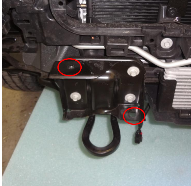
Figure 3a (TOW HOOK & OEM MOUNTING BRACKET)