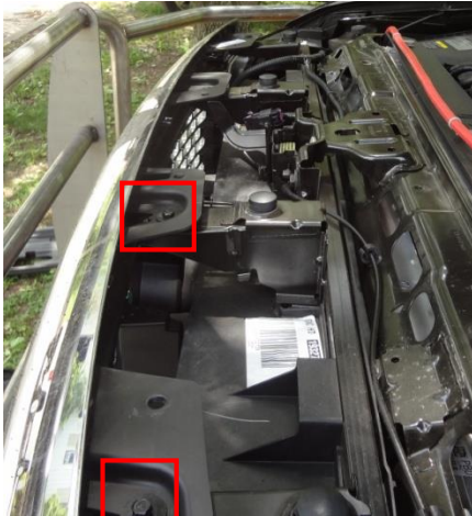
Figure 2a-bolts on LH side

B. Remove the fasteners connecting the grill to the frame with a 10mm socket. Four bolts are located at the top of the grill, two on each side (Ref. Figure 2a-b). There are multiple clips holding the grill to the vehicle.