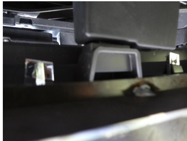
Figure 2c- example of clip holding grill