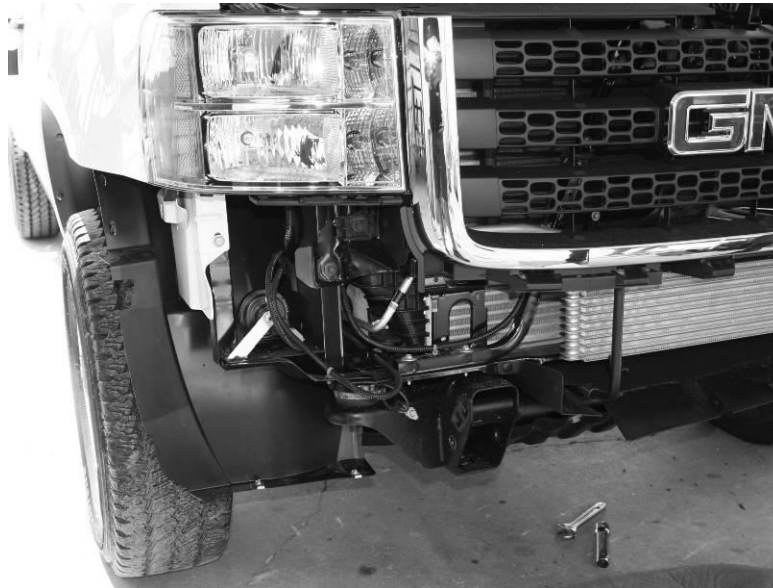
Figure 7 - Disassembly Complete