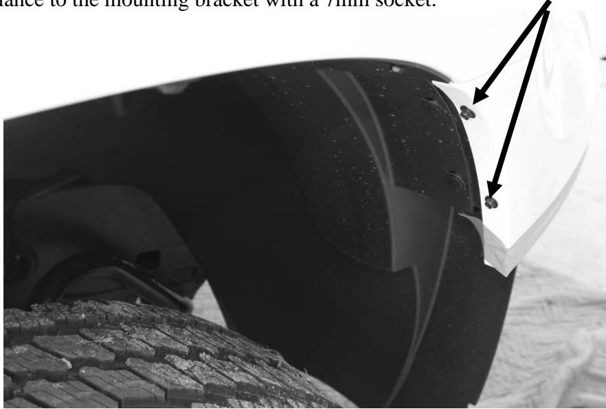
Figure 2 - Screw locations