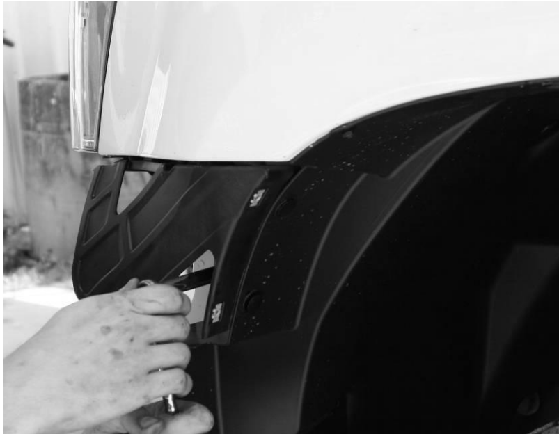
Figure 6 - Support Bracket Removal