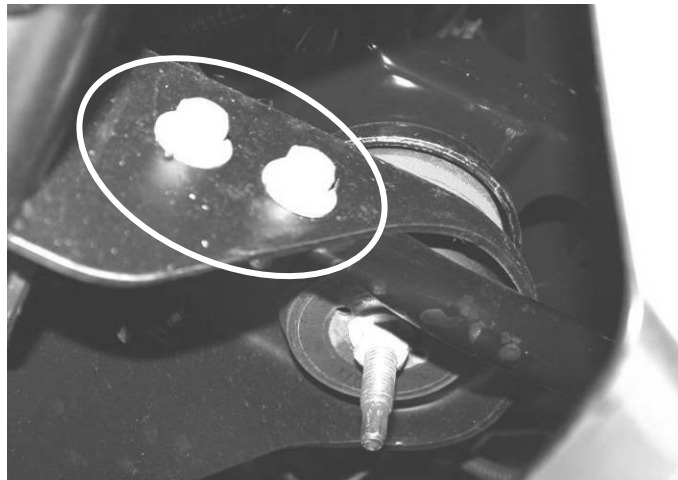
Figure 4 – Outer Bumper Support Screws