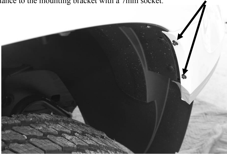
Figure 2 - Screw locations