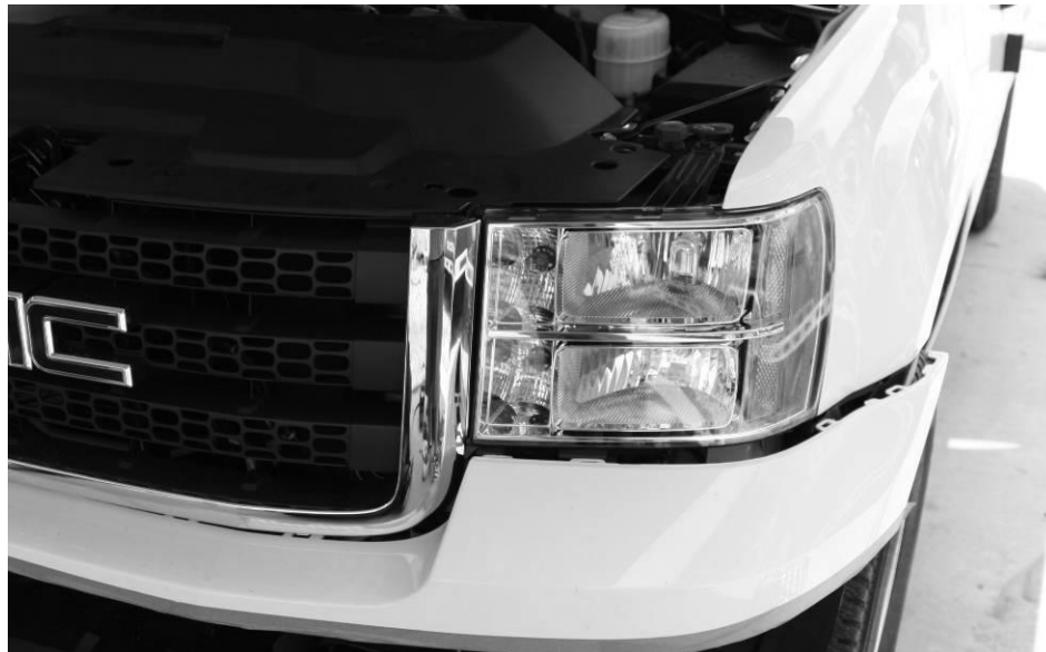
Figure 3 - Valance Removal