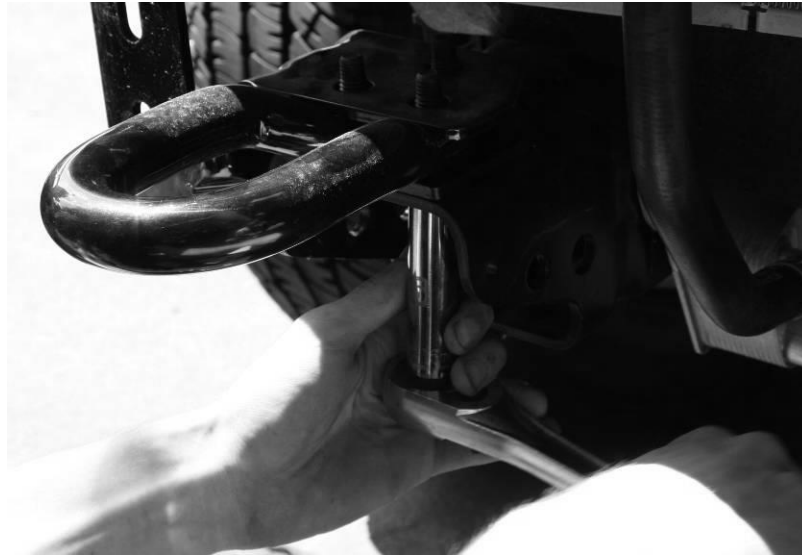
Figure 3 - Tow Hook Removal