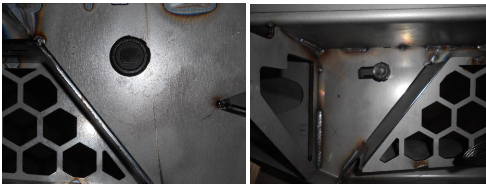
Figure 4c (Outer drivers side)