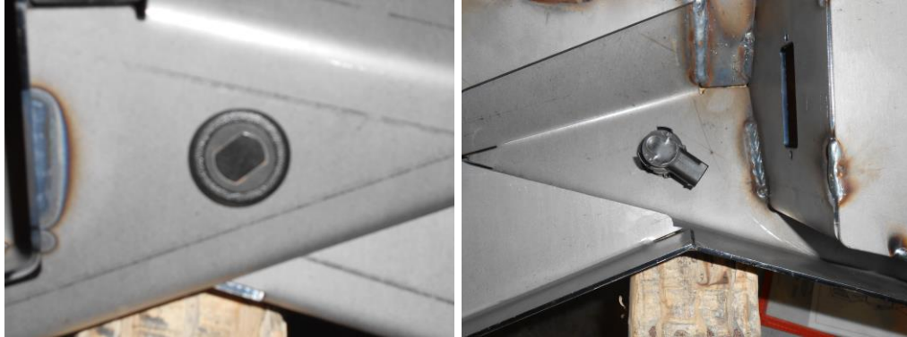
Figure 4e (inners passenger side)