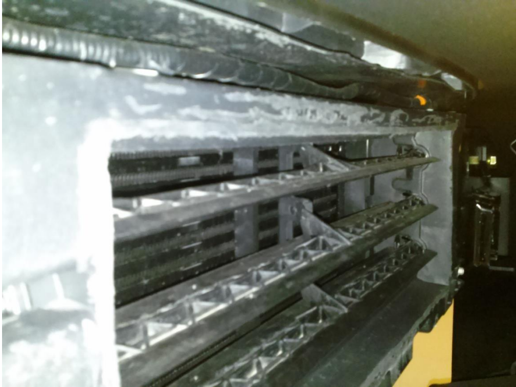
Figure 4 (Louver w/ shroud cut away at base)