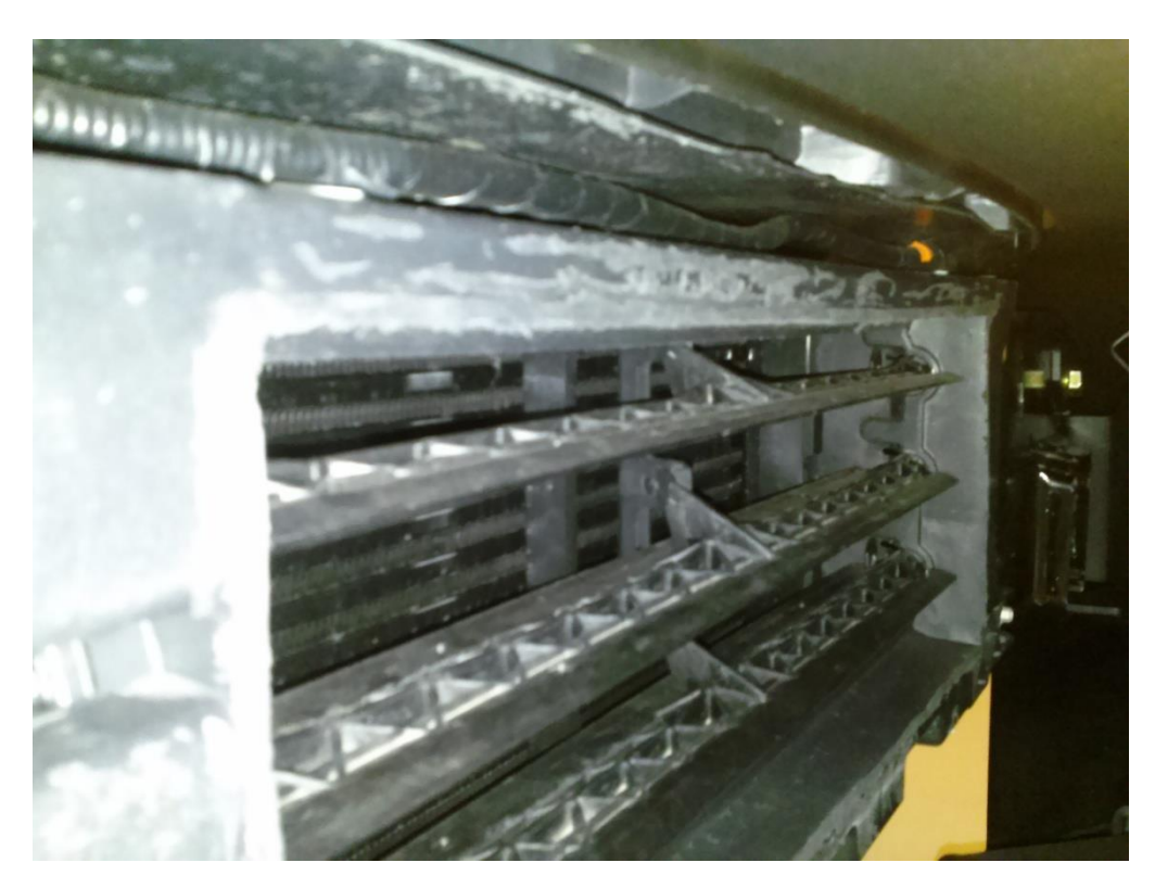
Figure 4 (Louver w/ shroud cut away at base)

<u>be taken not to damage louvers when cutting around the base</u> of the rectangular shroud, a cut off wheel is recommended.