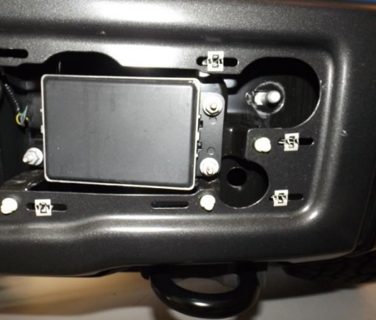
Figure 2a Figure 2b