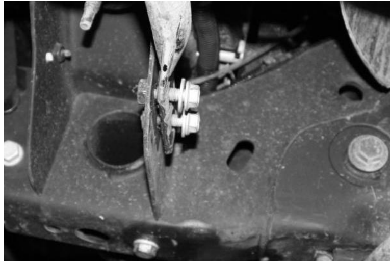
Figure 2 – Outer Bumper Support Screws