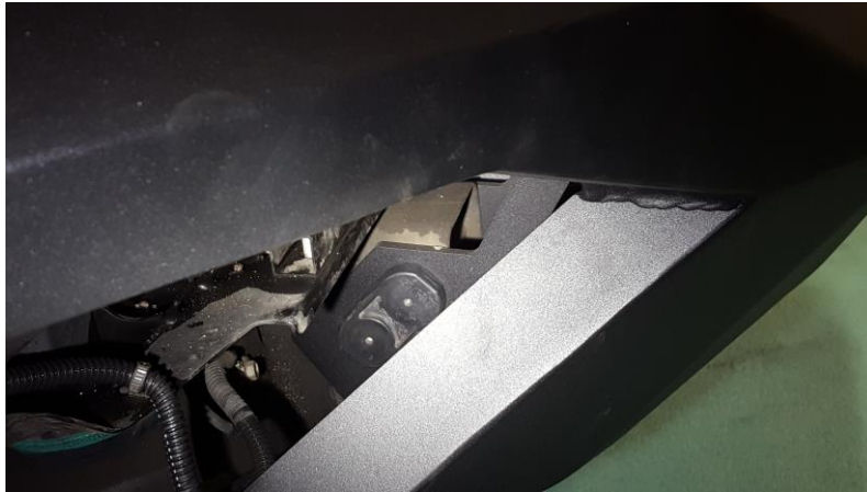
Figure 7 – Stud Plate Orientation