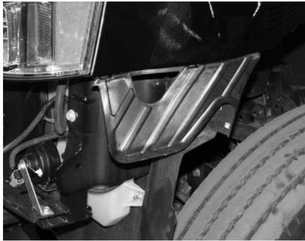
Figure 5 - SUPPORT STRUCTURE LOCATION