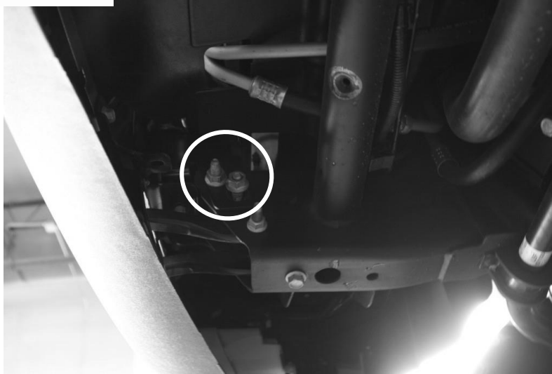
Figure 3 - STUD PLATE NUT LOCATION