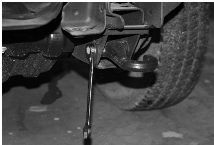
Figure 4 - TOW HOOK