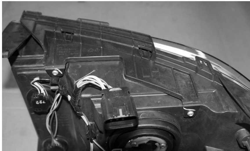
Figure 6 - TORX LOCATION