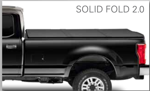
SOLID FOLD 2.0