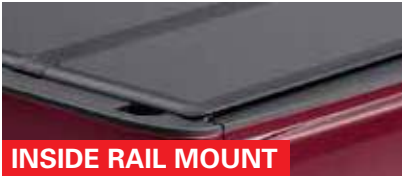
INSIDE RAIL MOUNT