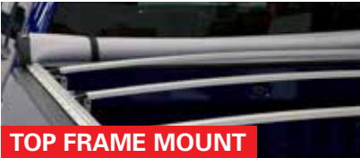
TOP FRAME MOUNT