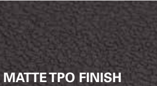
MATTE TPO FINISH