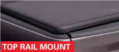
TOP RAIL MOUNT