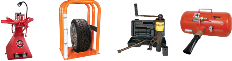
Tire Spreaders • Tire Inflation Cages • Torque Tools • Tire Inflators