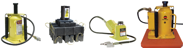
Air Hydraulic Bottle Jacks • Cribbing • Jack Support Plates