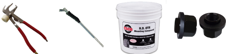
Wheel Weight Hammers • Valve Stem Pullers • Tire Lube • Wheel Attaching Parts