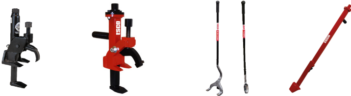
Manual & Pneumatic Bead Breakers • Manual Tire Demounting Tools