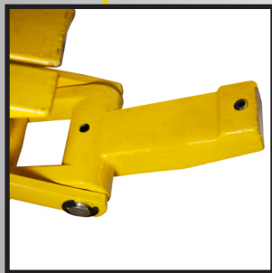
Redesigned replaceable clamping jaw.