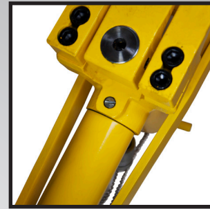
Adjustable redesigned sequence valve screw.