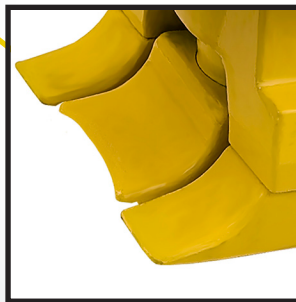
Redesigned replaceable pushing foot.