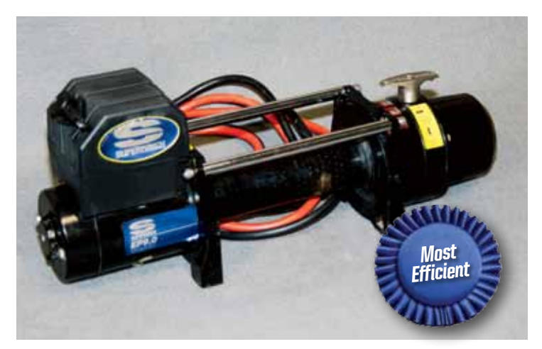
The Superwinch EP9.0 features super flexible 2 AWG battery cables and a elegant gloss-black finish.