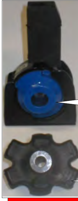
Bushing 1259 Sleeve 15.10.597.39 (NOT SHOWN)