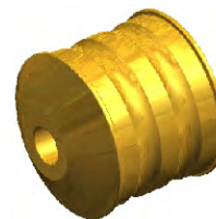
15.10.465.39 Sleeve x 2