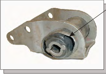
Remove rubber and metal sleeve from inside the metal shell.