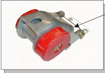
Complete engine mount assembly.