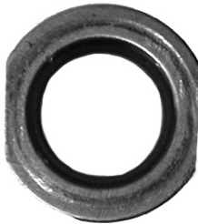
Figure 2 - #1 Head Bolt Washer