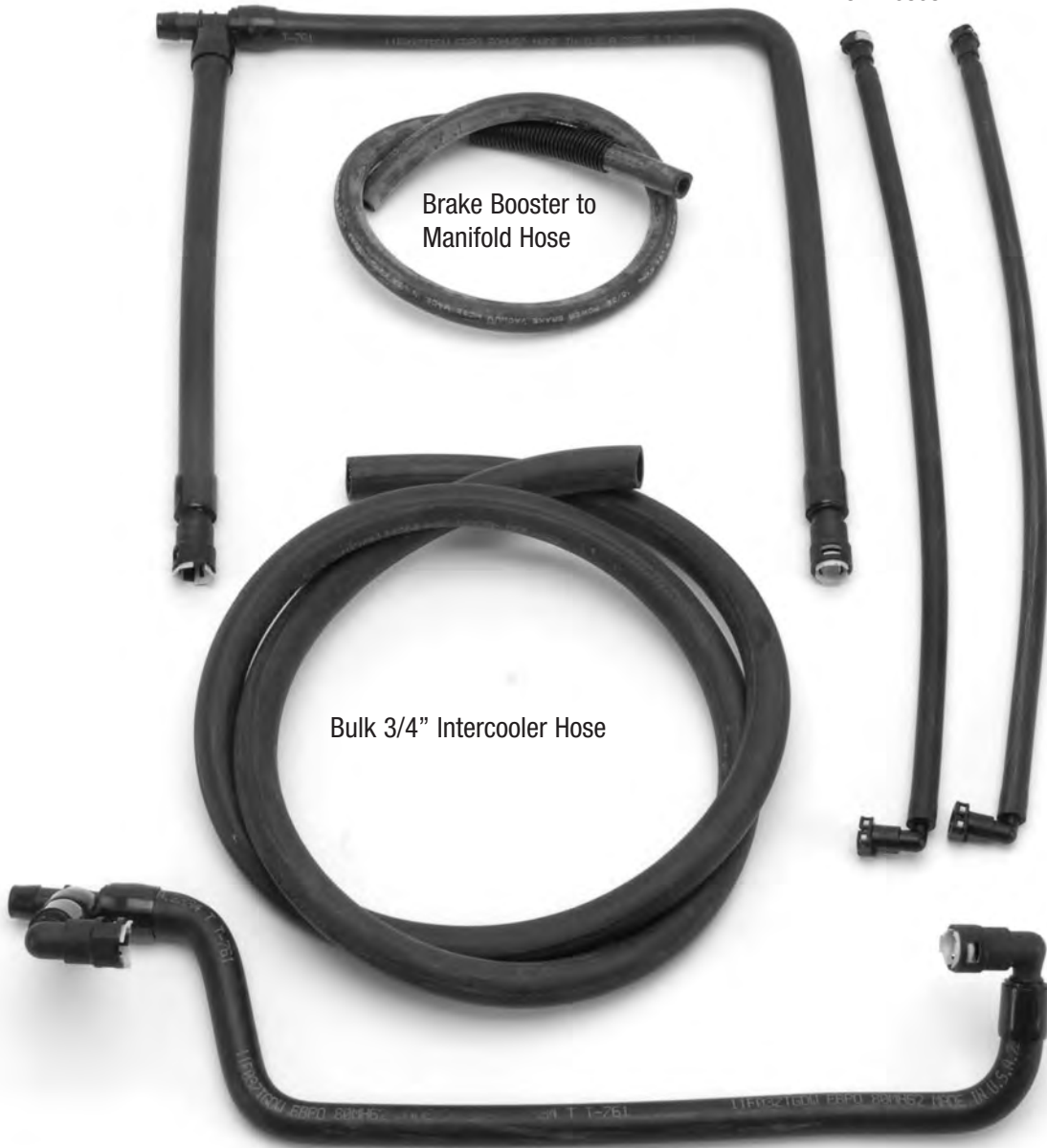
Intercooler Inlet Hose