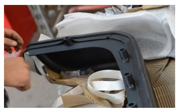
FOAM RUBBER TRIM

1. Included in your kit you will find a length of foam rubber trim shaped like a "P" when viewed from the end. Adhere this trim onto each flare mounting plate using its adhesive backing. When positioning the trim, the very top of the "P" should be even with the top edge of the flare mounting plate or slightly above it. You'll need to apply this trim along the entire length of the flares' mounting plate from end to end. If you experience the trim bunching up while applying it along the curved areas of the mounting plate, you may make some triangular relief cuts up to the 'pillow' section to help