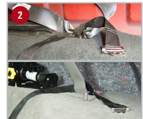
Photo shows two models of seat belt brackets, straps should loop through.