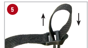
Ribs on buckle should face up. Thread strap through buckle as shown.