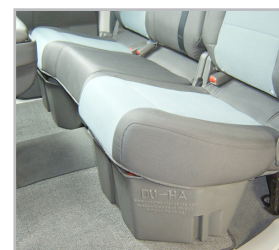
This is how the DU-HA should look installed under the back seat.