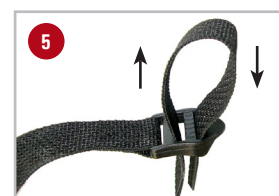
Ribs on buckle should face up. Thread strap through buckle as shown.