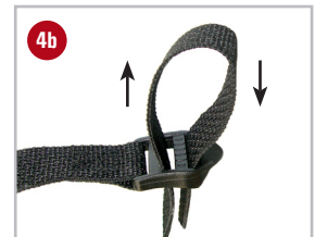
Ribs on buckle should face up. Thread strap through buckle as shown.