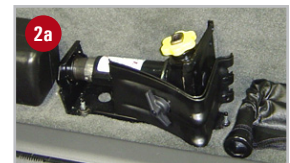
Remove wheel blocks from jack, then loosen jack.