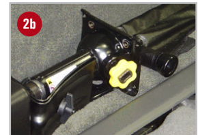
Rotate jack so yellow knob faces outward (as pictured).