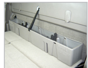
This is how the DU-HA should look installed behind the back seat.