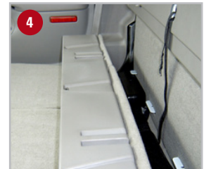
The DU-HA bolts to rear floor flaps to allow access to jack when tilted forward.