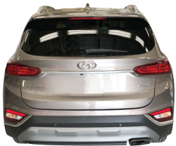
Hyundai Santa Fe