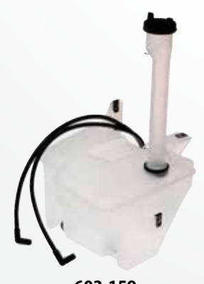
603-159 Ford Explorer 2010-02, Lincoln Aviator 2005-03, Mercury Mountaineer 2010-02