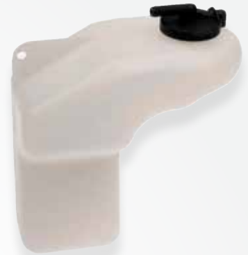
603-392 Chrysler Sebring, Dodge Stratus, 2005-01 Mitsubishi Eclipse 2005-98