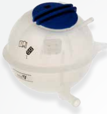
603-350 VW Beetle 2010-98