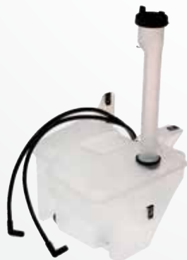
603-159 Ford Explorer 2010-02, Lincoln Aviator 2005-03, Mercury Mountaineer 2010-02