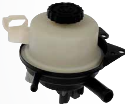
603-934 2007-01 Chrysler Caravan, Grand Caravan, Town & Country, Voyager