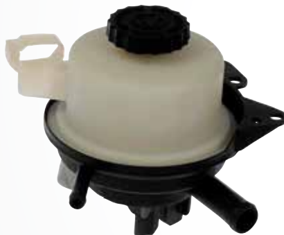
603-934 2007-01 Chrysler Caravan, Grand Caravan, Town & Country, Voyager