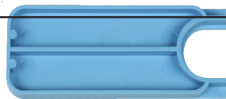
QUICK DISCONNECT TOOL

Learn more about other replacement transmission parts by Dorman on our website.