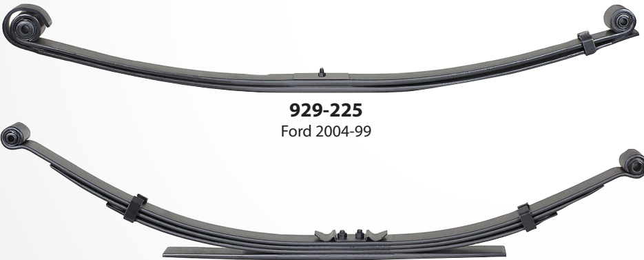
929-225 Ford 2004-99

Coverage Now Available for Popular Ford and Medium Duty Vehicles