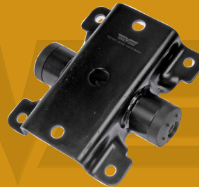
722-081 Chrysler, Dodge Minivan 2007-01